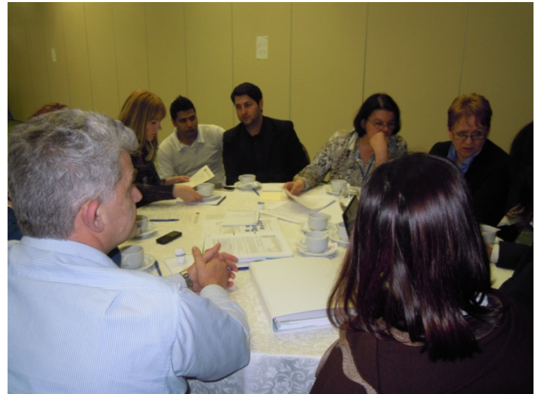
Multi-country training in Skopje, March 2013